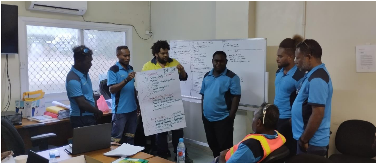
Photo caption: Solomon Water male staff presenting their domestic violence tree group activity during the training at Solomon Water's Mataniko Conference Room.